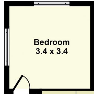
Bedroom 3.4 x 3.4