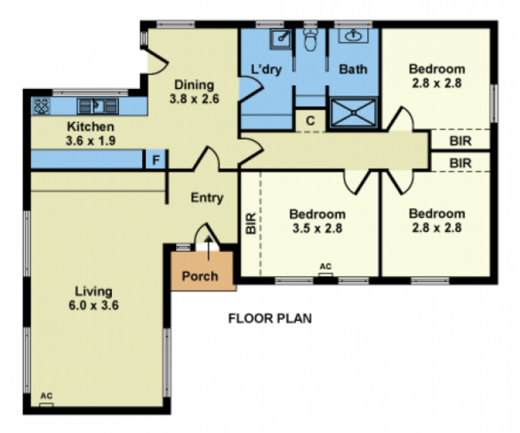
Whilst every attempt has been made to ensure the accuracy of this floorplan, measurements of doors, windows, rooms and any other items are approximates only. The producer or agent cannot be held responsible for any errors, omissions or misstatements. This plan is for illustrative purposes only and should be used as such.